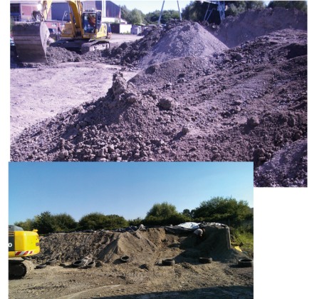
From a heterogeneous to a homogeneous source material (bottom right)

Mechanically well-prepared source material is the basic requirement for the production of RSS Flüssigboden®. If the source soil is not homogeneous, it is necessary to process as a first step. The tolerance range for slump and inherent moisture content given in the mix design are decisive for mechanical processing requirements. If compliance with these tolerances is not possible, the source material must be further processed, eg by means of shovel separator. ATTENTION: the mechanical processing can be a complex and thus cost-intensive factor in the production of RSS Flüssigboden®. If necessary, talk to your technical planner or a FiFB staff member beforehand. If the source material as a whole is not to be considered as granular, or if there are strongly cohesive areas, then the source material should be activated with RSS PROVIACAL RD during homogenisation.